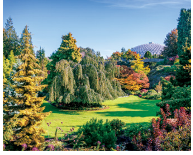
Images, clockwise from top: The view from Queen Elizabeth Park to downtown Vancouver and the North Shore Mountains; Langara Golf Course; Queen Elizabeth Park; Riley Park.