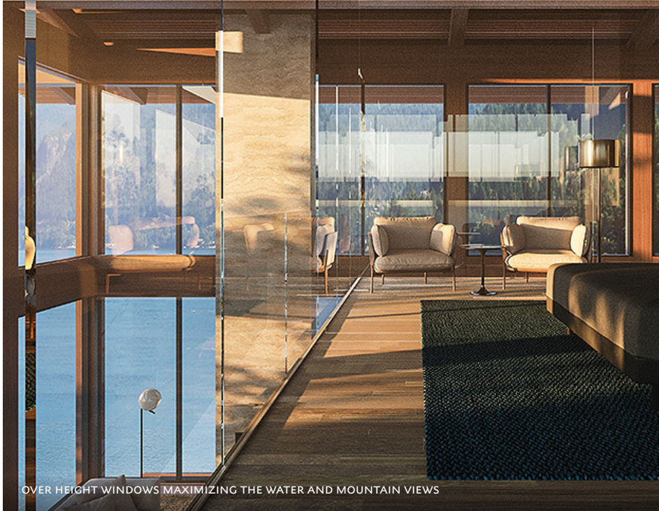
OVER HEIGHT WINDOWS MAXIMIZING THE WATER AND MOUNTAIN VIEWS