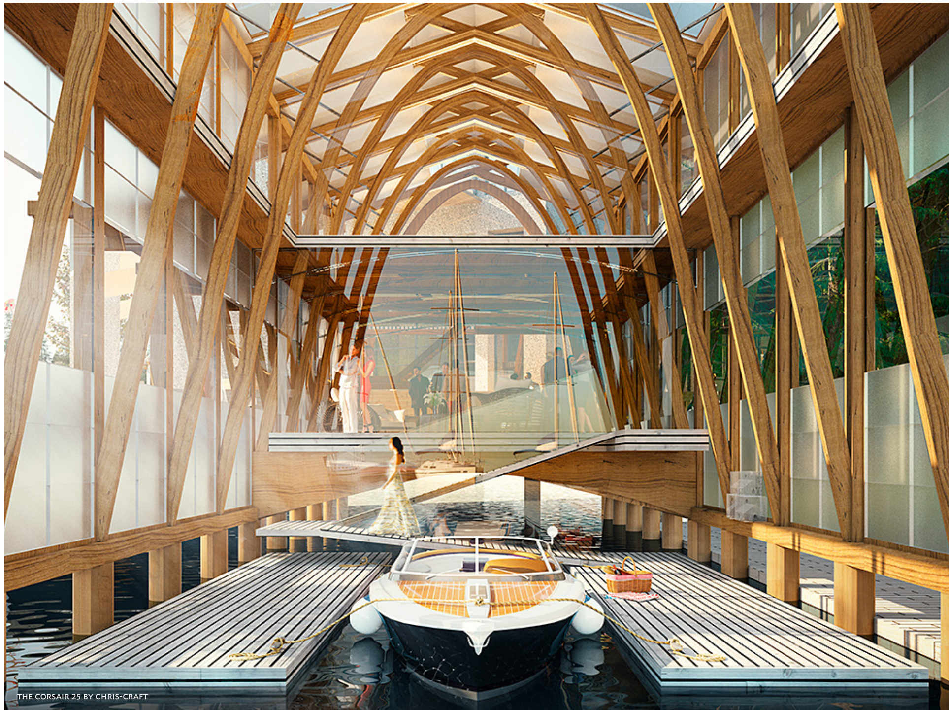
THE CORSAIR 25 BY CHRIS-CRAFT