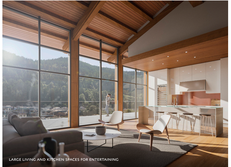
LARGE LIVING AND KITCHEN SPACES FOR ENTERTAINING