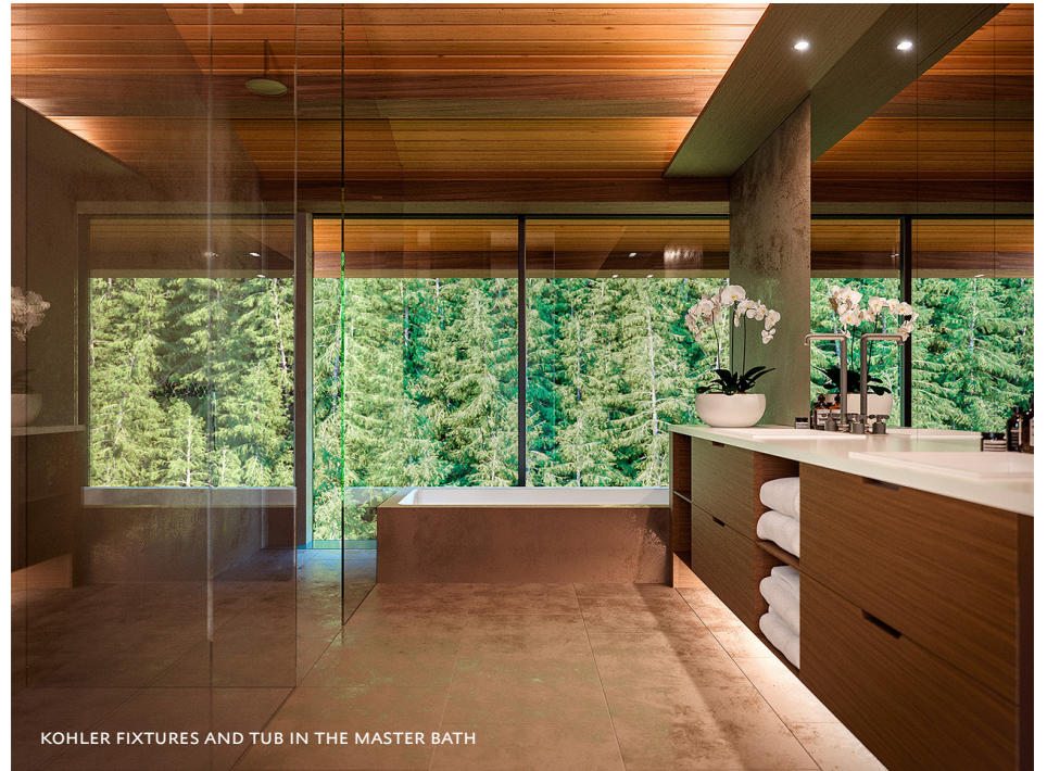
KOHLER FIXTURES AND TUB IN THE MASTER BATH